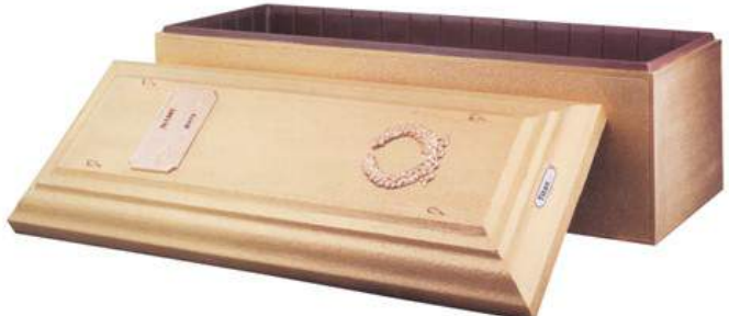
Pictured is a Titan Doric Vault painted in a one tone gold color.