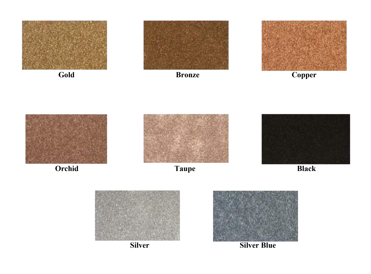
Two tone colors available in the following Doric vaults: Bronze • Lydian • Athenian • Patrician • Phoenix • Tiara