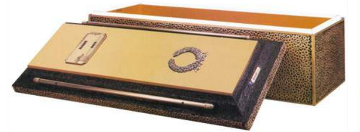
Pictured is a Bronze Doric Vault painted in a two tone color bronze with gold highlights.